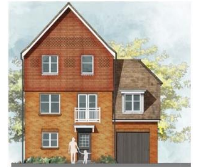
HAZEL Tile hanging and brick base. Gabled unit.