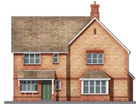
CT1 AND ROWAN Brick and plain tile roof