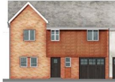
MH1 OPTION 2 Brick and tile hanging and slate roof