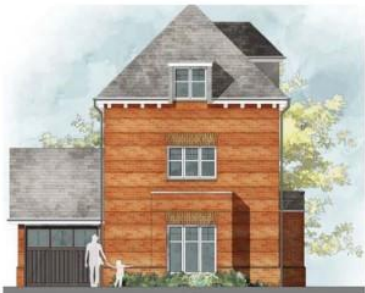
TOWN-HOUSE 1 Brick, slate, rusticated brick to ground floor facing the western green.