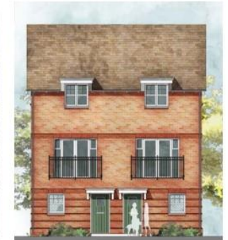
ROCKPORT Brick, slate, rusticated brick to ground floor facing the Green avenue.