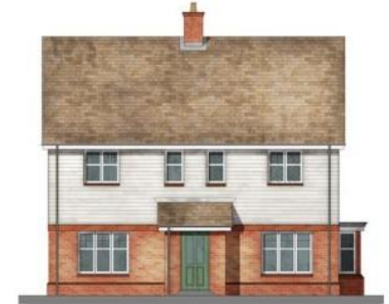
CT1 White boarding and plain tile roof