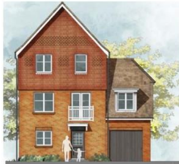
HAZEL Brick and Tile hanging facing the western green.