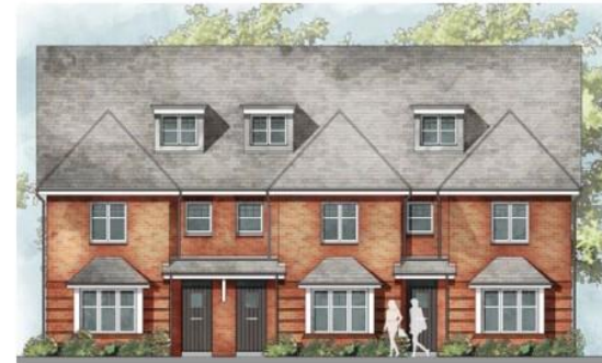
LAVENDER Brick, slate, rusticated brick to ground floor facing the western green.