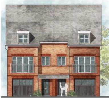
TOWN-HOUSE 3 Brick, slate, rusticated brick to ground floor facing the western green.