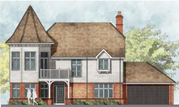
TURRET Corner Unit with White Boarding.