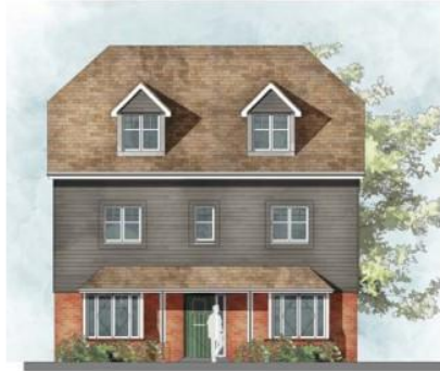
CT2 Black Boarding and brick base. Gabled unit.