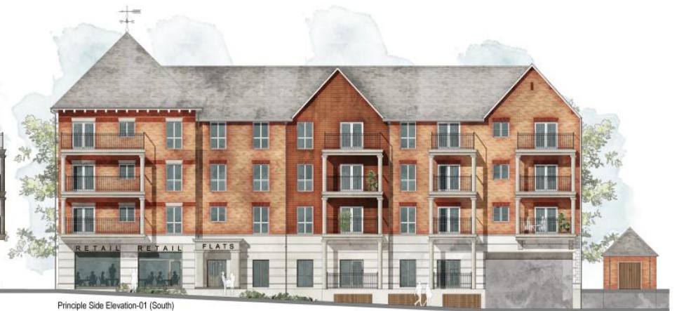
Principle Side Elevation-01 (South)