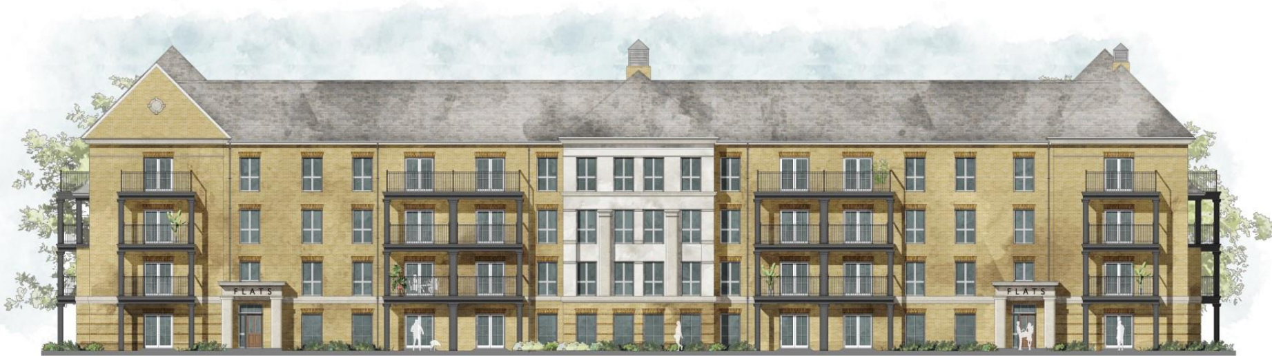
Front Elevation - East