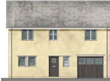
MH1 OPTION 1 Coloured render and slate roof