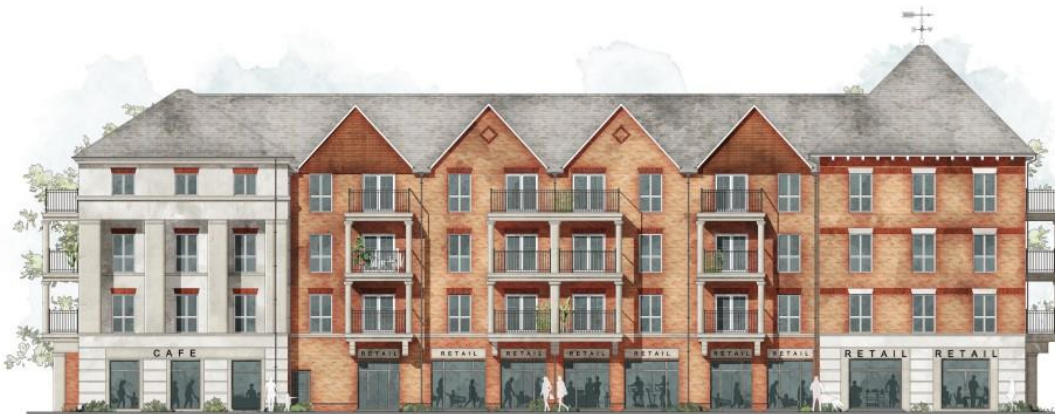
Principle Front Elevation (West)