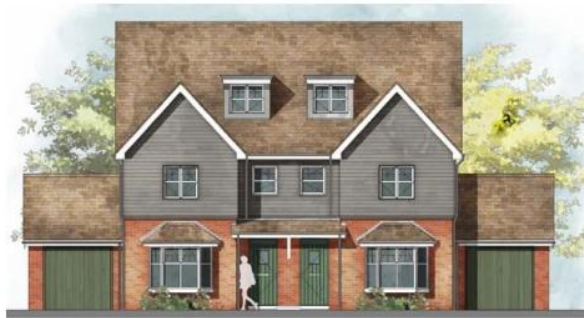
LAVENDER Black Boarding and brick base. Gabled unit.